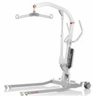
Eva600EE, with low legs.