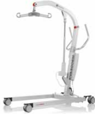
Eva400EM, with manual base-width adjustment.