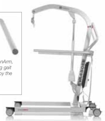
Eva450EE, with AmbulationArm

The armrests accessory, AmbulationArm, can be employed by the user during gait training but they can also be used by the carer for manoeuvring the lift.