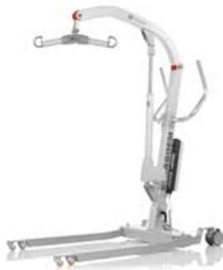
Eva450EM, with manual base-width adjustment, only available with low legs.