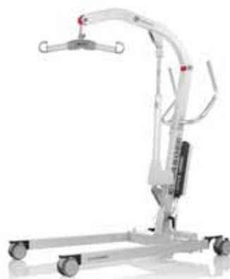
Eva450EE, with electrical base-width adjustment, for users weighing up to 205 kg/ 450 lbs.