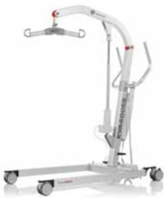
Eva400EE, with electrical base-width adjustment, for users weighing up to 180 kg/ 400 lbs.