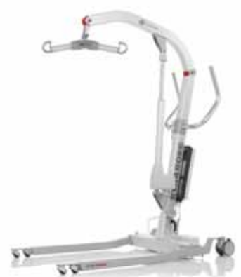
Eva450EE, with low legs.