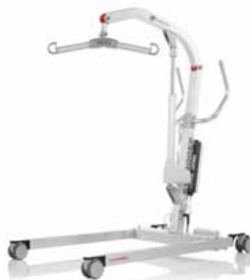
Eva600EE, with electrical base-width adjustment, for users weighing up to 270 kg/ 600 lbs.