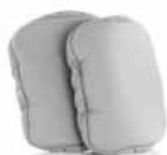
Padding for leg support